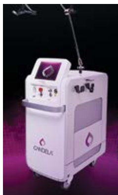
GentleMax Pro Plus

Pigment ◆ Maturity ◆ Redness ◆ Rosacea ◆ Hair Removal